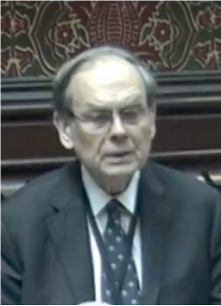
The Earl of Sandwich

No one can have anything but admiration for the work of the Loomba Foundation and the efforts that my noble friend has made not only in changing lives in India but in influencing our Government. This was especially true during the coalition, when we had a real department for international development that began to focus on gender equality and violence against women, including widows. I expect that our new Minister will say that this policy continues, but this week's news that our core aid programme, including the one helping women and girls, is being raided yet again to assist, in