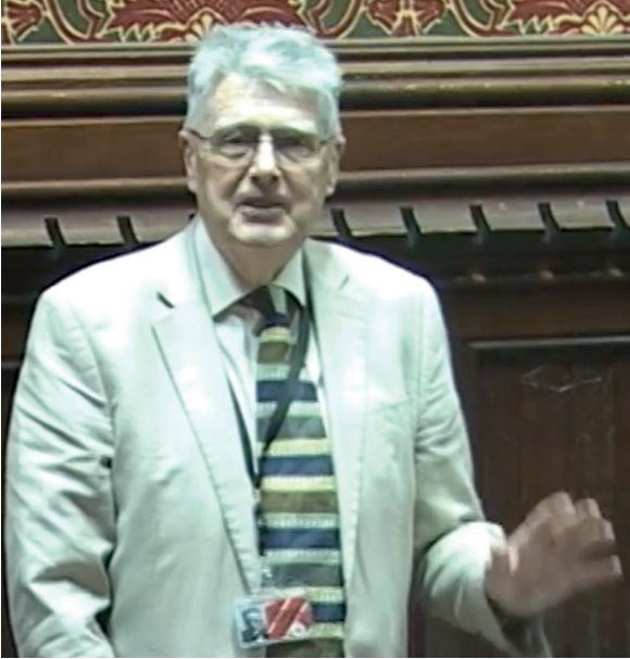
Lord Davies of Brixton

to poverty all too often. This brings me to the focus of my remarks: a large part of that is about pensions and inadequate provision for people who have to face the problems of widowhood.